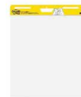
559 Easel Pad - White Size: 25"x 30"x 30 Sheets