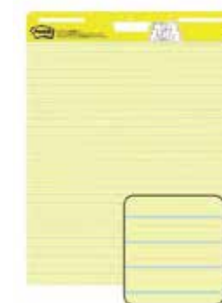
561 Easel Pad - Yellow Lined Size: 25"x 30"x 30 Sheets