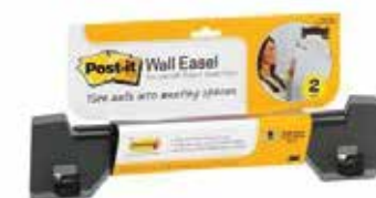
EH559 Easel Wall Hanger

Product Disclaimer: Brought only against confirmed orders