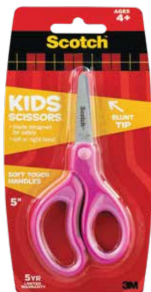
5" Soft Grip Blunt Tip Kids Scissors