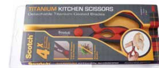
8" Titanium Kitchen Scissors