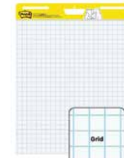
560 Easel Pad - Bluegrid Size: 25"x 30"x 30 Sheets