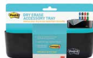
Dry Erase Accessory Tray