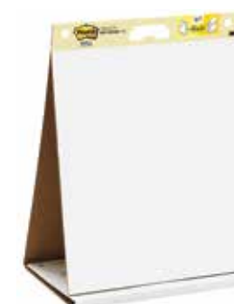
563 DE Easel Pad - Table Top with Dry Erase Size: 20"x 23"x 20 Sheets