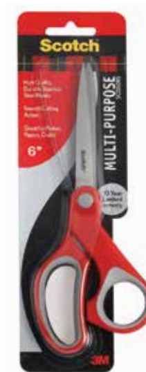
6" Multi-Purpose Scissors