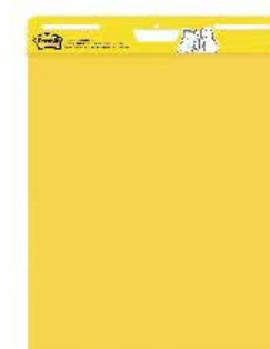
559 Yellow Easel Pad Size: 25"x 30"x 30 Sheets