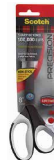
6" Precision Ultra Edge Non-Stick Scissors